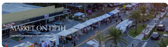
Propagate Friday Night Market