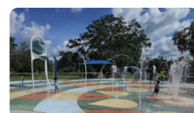
Kit Land Nelson Park